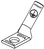
ONE HOLE 1/4" STUD, STANDARD BARREL COPPER LUG BENT 45° (QTY. 1)